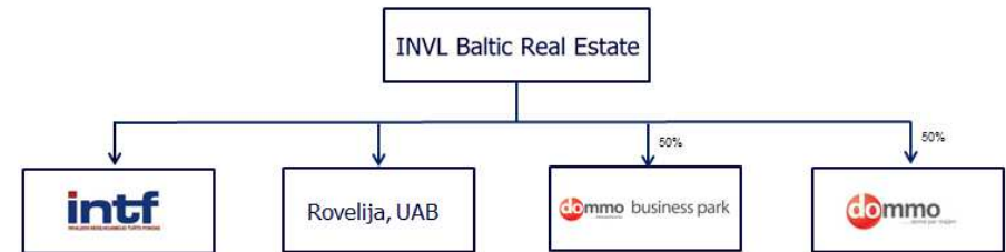
Simplified group structure of INVL Baltic Real Estate, AB

INVL Baltic Real Estate, AB later will apply to the Bank of Lithuania for closed-end investment company license and in its essence will become similar to investment fund.