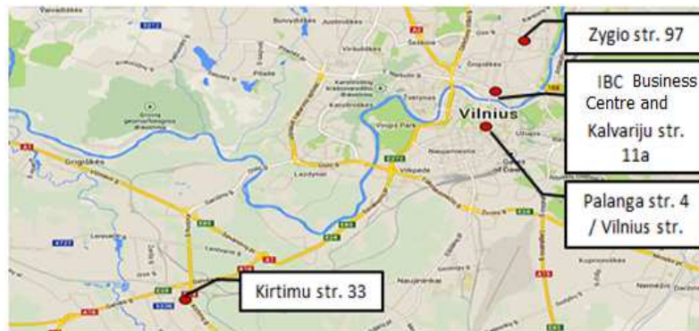
Real estate objects owned by group companies of INVL Baltic Real Estate, AB in Vilnius (Lithuania)