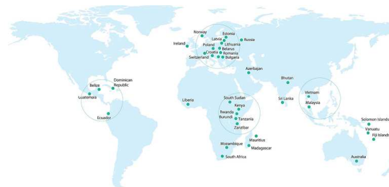
Scope of activity of BAIP group, UAB

INVL Technology, AB later will apply to the Bank of Lithuania for closed-end investment company license and in its essence will become similar to investment fund.